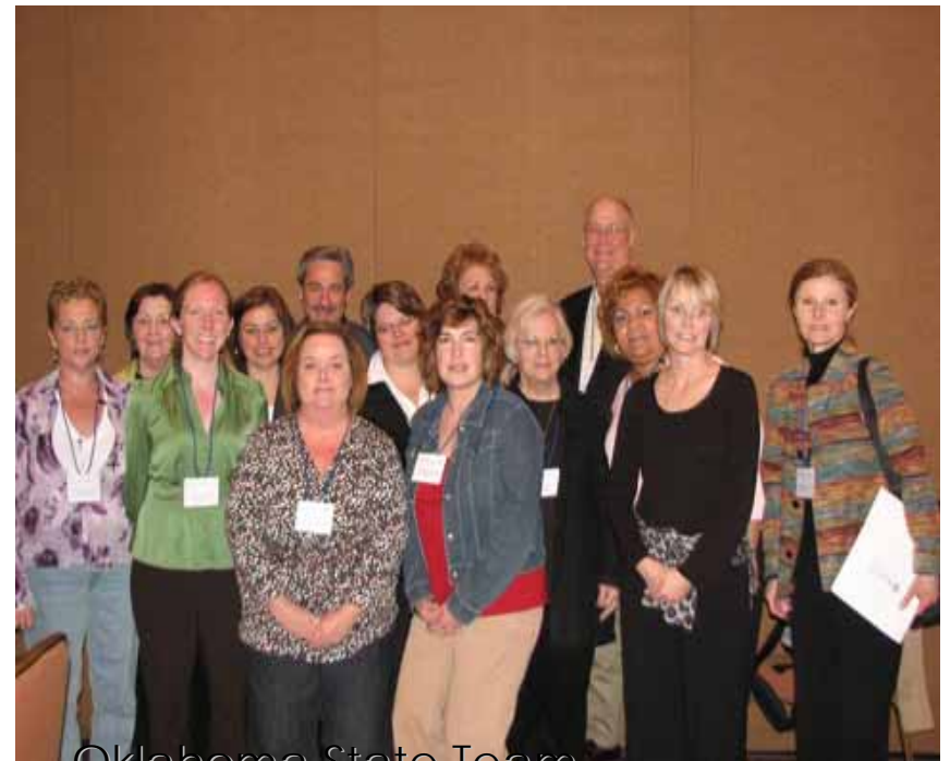
Oklahoma State Team

Region VI Summit (Arkansas, New Mexico, Louisiana, Oklahoma, and Texas) - Albuquerque, NM March 2008